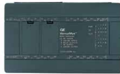
Micro PLCs , pages 9.6-9.13