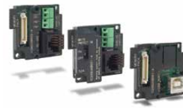
Communications Options , pages 9.26-9.27