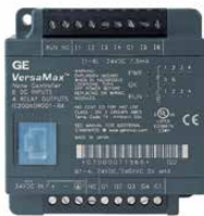
Nano PLCs , page 9.5