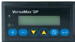
DataPanel Operator Interfaces , page 9.25