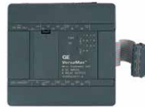
Expansion Units , pages 9.14-9.24