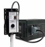
Portable Program Download Device (PPDD) , pages 9.28-9.29